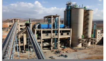
Minerals & Cement