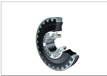
GKN Stromag Periflex® VN Disc Coupling