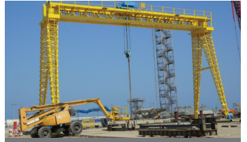
Crane & Hoist