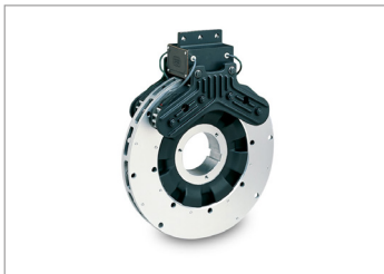
Warner Tension Brake