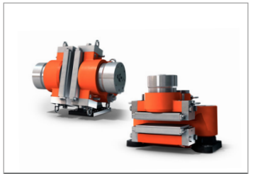
Svendborg Caliper Brakes