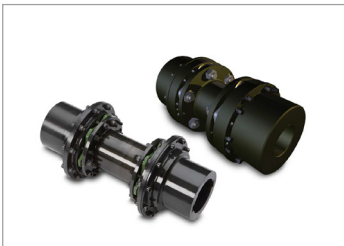
Ameridrive Gear Coupling