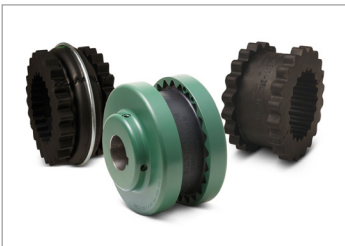
Sure-Flex Plus® Couplings