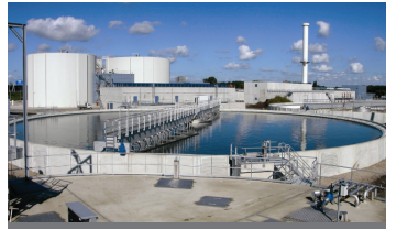
Water & Wastewater Treatment