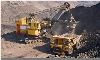
Mining & Extraction