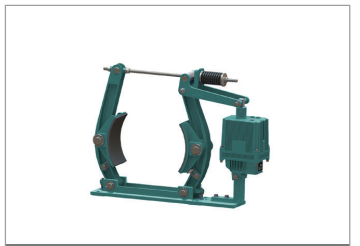
SDB Series Electro-Hydraulic Thruster Drum Brake