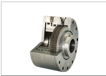
Multi-Disc Clutches for Marine Gears