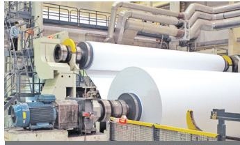
Pulp & Paper