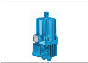
Eldro® Standard Series