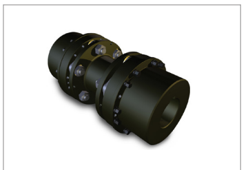
Tosiflex Disc Coupling